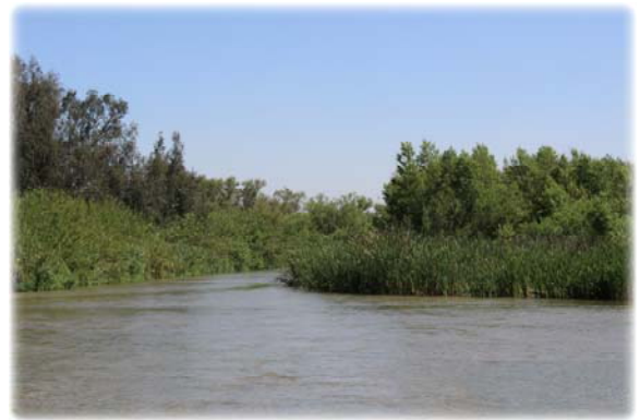
Santa Ana River Near Archibald Ave

Watermaster collects grab water quality samples at two sites along the Santa Ana River (Santa Ana River at River Road and Santa Ana River at Etiwanda) on a quarterly basis. Along with data collected at four wells near the Santa Ana River, these data are used to characterize the interaction between the Santa Ana River and nearby groundwater. During this reporting period, Watermaster collected four surface water quality samples.