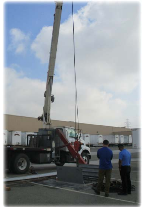
Well Repair at a Water Quality Sampling Site

Hydraulic Control and Chino Desalters. One of the main maximum-benefit commitments is to achieve and maintain "Hydraulic Control" of the Chino Basin through operation of the Chino Basin Desalters to protect downstream beneficial uses of the Santa Ana River. The Chino Basin Desalters are required to replace the diminishing agricultural production that previously prevented the outflow of high TDS and nitrate groundwater. Hydraulic Control is defined by the Basin Plan as the elimination of groundwater discharge from