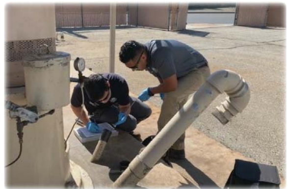
Ops Staff Taking a Groundwater Level Measurement

All groundwater level data are checked and uploaded to a centralized database management system that can be accessed online through HydroDaVE sm . During this reporting period, Watermaster measured about 420 manual water levels at about 70 wells throughout the Chino Basin and conducted two quarterly downloads of 145 pressure transducers installed in private, municipal, and monitoring wells. Additionally, Watermaster compiled all available groundwater-level data from well owners in the basin for the April 2018 to October 2018 period.