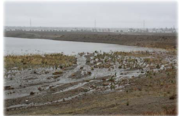
Stormwater Flowing Into San Sevaine 1 Basin

Watermaster and the IEUA measure the quantity of storm and supplemental water that enters recharge basins using pressure transducers or staff gauges. Staff also collect weekly water quality samples from recharge basins actively recharging recycled water and from lysimeters installed within those recharge basins. Imported water quality data for State Water Project water are obtained from the Metropolitan Water District of Southern California (MWDSC) and recycled water quality data for RP-1 and RP-4 treatment plant effluents are obtained from the IEUA. Combining measured flow data with respective water quality data enables the calculation of the blended water quality of the recharge sources in each recharge basin and the assessment of adequate dilution of recycled water, as required by the recycled water recharge permits held with the Division of Drinking Water (DDW). The recharge measurements are also used to estimate the New Yield to the Chino Basin due to recharge activities.