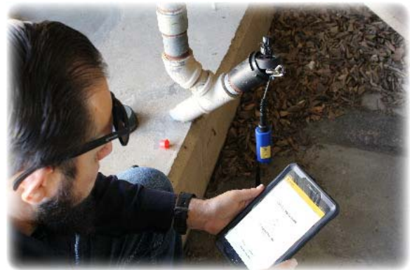
Setting a Transducer to Record Water Level Data

The current groundwater-level monitoring program is comprised of about 1,100 wells. At about 900 of these wells, water levels are measured by well owners, which include municipal water agencies, the California Department of Toxic Substances Control (DTSC), the Counties, and various private consulting firms. Watermaster collects these water level data at least semi-annually. At the remaining 200 wells, water levels are measured by Watermaster staff using manual methods once per month or by using pressure transducers that record data once every 15 minutes. These wells are mainly Agricultural Pool wells or dedicated monitoring wells located south of the 60 freeway.