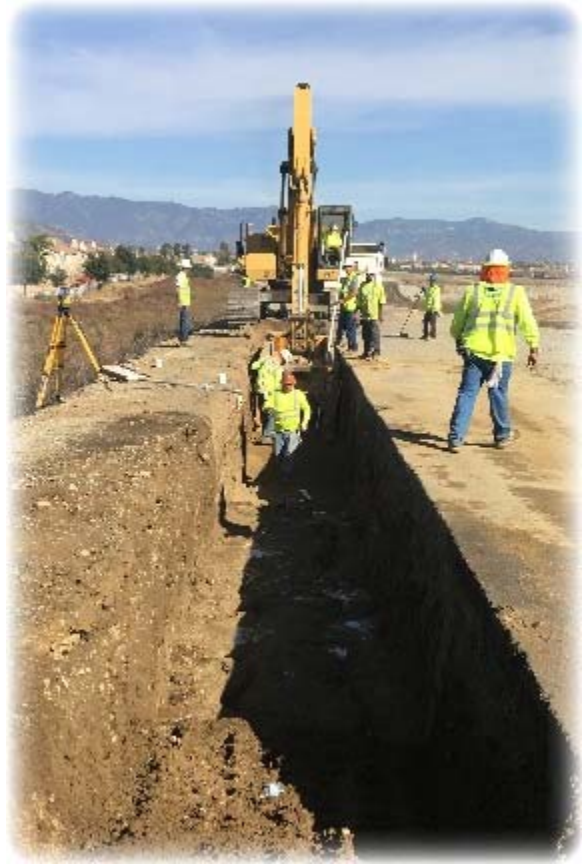
Trenching for a Pipeline at San Sevaine Basin

The Chino I Desalter Expansion and the Chino II Desalter facilities were completed in February 2006. As currently configured, the Chino I Desalter produces about 13,500 acre-feet of groundwater per year (12.1 million gallons per day [MGD]) at 15 wells (I-1 through I-15). This water is treated through air stripping (volatile organic compound [VOC] removal), ion exchange (nitrate removal), and/or reverse osmosis (for nitrate and TDS removal). The Chino II Desalter produces about 15,800 acre-feet of groundwater per