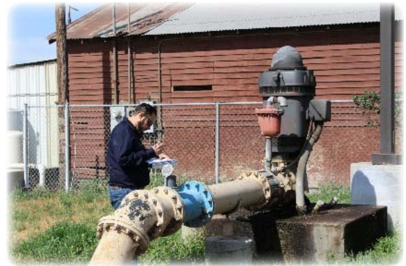
Reading a Meter on an Agricultural Well

Watermaster collects grab water quality samples at two sites along the Santa Ana River (Santa Ana River at River Road and Santa Ana River at Etiwanda) on a quarterly basis. Along with data collected at four wells near the Santa Ana River, these data are used to characterize the interaction between the Santa Ana River and nearby groundwater. During this reporting period, Watermaster collected four surface-water quality samples.