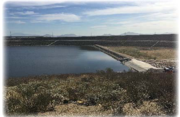
San Sevaine 5 Basin

Monitoring Activities. During this reporting period, the IEUA performed its ongoing monitoring program to measure and record recharge volumes and to collect stormwater quality samples pursuant to its permit requirements. Also, during this reporting period, approximately 84 recharge basin and lysimeter samples were collected for water quality analysis, and 28 recycled water samples were collected for alternative water quality monitoring plans, including the application of a correction factor for soil-aquifer treatment, determined from each recharge basin's startup period. Monitoring wells located downgradient of the recharge basins were sampled, at a minimum, on a quarterly basis; that said, some monitoring wells were sampled more frequently during the reporting period for a total of 126 samples.