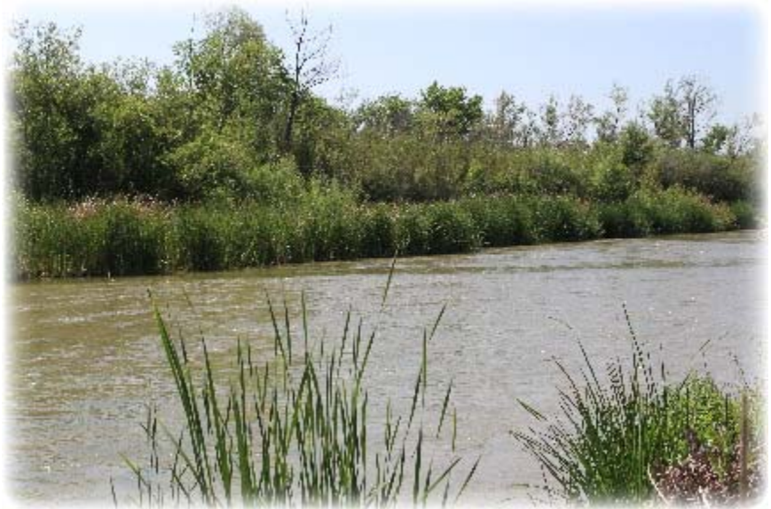
Santa Ana River