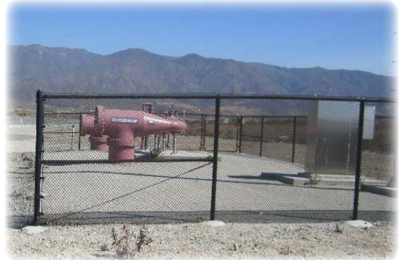
Recycled Water Line at the San Sevaine Basin #5.

Ambient Water Quality. Commitment number 9 requires that Watermaster and the IEUA recompute ambient TDS and nitrate concentrations for the Chino Basin and Cucamonga GMZs every three years. The recomputation of ambient water quality is performed for the entire Santa Ana River Watershed, and the technical work is contracted, managed, and directed by the Santa Ana Watershed Project Authority's Basin Monitoring Program Task Force. Watermaster and the IEUA have participated in each triennial, watershed-wide ambient water quality determination as members of the Task Force. The most recent recomputation, covering the 20-year period from 1993 to 2015, was completed in September 2017.