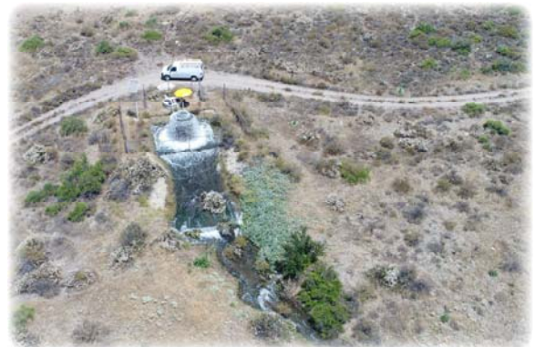
MWD Delivery North of the San Sevaine Basins.

Balance of Recharge and Discharge in MZ-1. The total amount of supplemental water recharged in MZ-1 since the Peace II Agreement through December 31, 2017 was approximately 84,170 acre-feet, which is about 15,920 acre-feet more than the 68,250 acre-feet required by that date (annual requirement of 6,500 acre-feet). The amount of supplemental water recharged into MZ-1 during the reporting period was approximately 20,539 acre-feet.