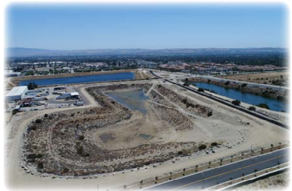
College Heights Basin receiving imported water.

Watermaster and the IEUA measure the quantity of storm and supplemental water that enters recharge basins using pressure transducers or staff gauges. Staff also collect weekly water quality samples from recharge basins actively recharging recycled water and from lysimeters installed within those recharge basins. Imported water quality data for State Water Project water are obtained from the Metropolitan Water District of Southern California (MWDSC) and recycled water quality data for RP-1 and RP-4 treatment plant effluents are obtained from the IEUA. Combining measured flow data with respective water quality data enables the calculation of the blended water quality of the recharge sources in each recharge basin and the assessment of adequate dilution of recycled water, as required by the recycled water recharge permits held with the Department of Drinking Water (DDW). The recharge measurements are also used to estimate the New Yield to the Chino Basin due to recharge activities.