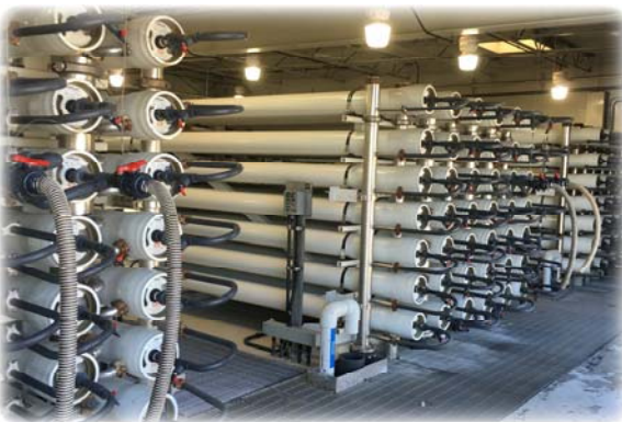
Chino Desalter I Facility

In January 2004, the Regional Board amended the Basin Plan to incorporate an updated total dissolved solids (TDS) and nitrogen (N) management plan. The Basin Plan amendment includes both "antidegradation" and "maximum benefit" objectives for TDS and nitrate-N for the Chino-North and Cucamonga groundwater management zones (GMZs). The maximum benefit objectives allow for the reuse and recharge of recycled water and the recharge of imported water without mitigation; these activities are an integral part of the OBMP. The application of the maximum-benefit objectives is contingent on Watermaster and the IEUA's implementation of specific projects and requirements termed the maximum-benefit commitments. There are a total of nine commitments and Watermaster and the IEUA report the status of compliance with each commitment to the Regional Board annually.