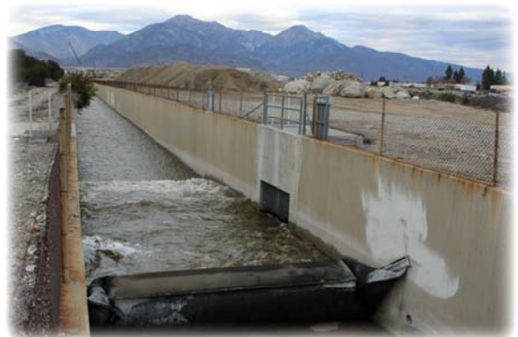
Capturing Imported Water at the College Heights Basins

Pursuant to PE2 of the OBMP, Watermaster and the IEUA partnered with the San Bernardino County Flood Control District and the Chino Basin Water Conservation District to construct and/or improve eighteen recharge sites. This project was known as the Chino Basin Facilities Improvement Project (CBFIP). The average annual stormwater recharge of the CBFIP facilities is approximately 10,000 acre-feet per year, the supplemental "wet" 1 water recharge capacity is approximately 74,700 acre-feet per year, and the in-lieu supplemental water recharge capacity ranges from 25,000 to 40,000 acre-feet per year. In addition to the CBFIP facilities, the Monte Vista Water District has five ASR wells with a demonstrated well injection capacity of 5,600 acre-feet per year. The current total supplemental water recharge capacity ranges from 105,300 to 120,300 acre-feet per year which is greater than the projected supplemental water recharge capacity required by Watermaster.