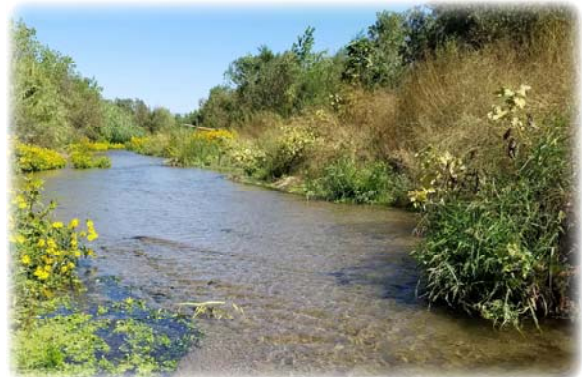
Santa Ana River

Watermaster collects grab water quality samples at two sites along the Santa Ana River (Santa Ana River at River Road and Santa Ana River at Etiwanda) on a quarterly basis. Along with data collected at four wells near the Santa Ana River, these data are used to characterize the interaction between the Santa Ana River and nearby groundwater. During this reporting period, Watermaster collected four surface-water quality samples.