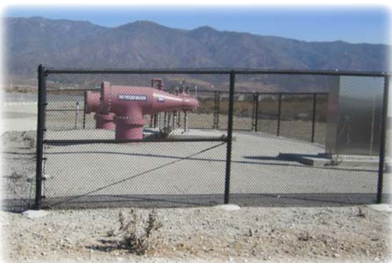
Recycled Water Line at the San Seivaine Basins

Although full hydraulic control has been achieved, future agricultural groundwater production in the southern part of the basin is expected to continue to decline, necessitating future expansion of the desalters to sustain hydraulic control. In a letter dated January 23, 2014, the Regional Board required that by May 31, 2014, Watermaster and the IEUA submit a plan detailing how hydraulic control will be sustained in the future as agricultural production in the southern region of Chino-North continues to decrease, specifically how the Chino Basin Desalters will achieve the required total groundwater production level of 40,000 acre-feet per year. On May 30, 2014 Watermaster and the IEUA submitted a draft plan and schedule to install three new desalter wells—with the location of one well being provisional. On June 30, 2015 Watermaster and the IEUA submitted a final plan and schedule for the construction and operation of the three new desalter wells including the final well locations. These wells are under construction. During this reporting period, Watermaster coordinated with the Chino Desalter Authority to track the progress of construction of the desalter expansion facilities. A full status report on the desalter expansion facilities is described in this status report under Program Element 3.