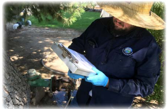
Watermaster Staff Taking WQ Sampling Notes

In 2008, Regional Board staff conducted research pertaining to the likely source of the TCE contamination and identified discharges of wastewater that may have contained TCE to the RP-1 treatment plant and associated disposal areas to be a potential source. The